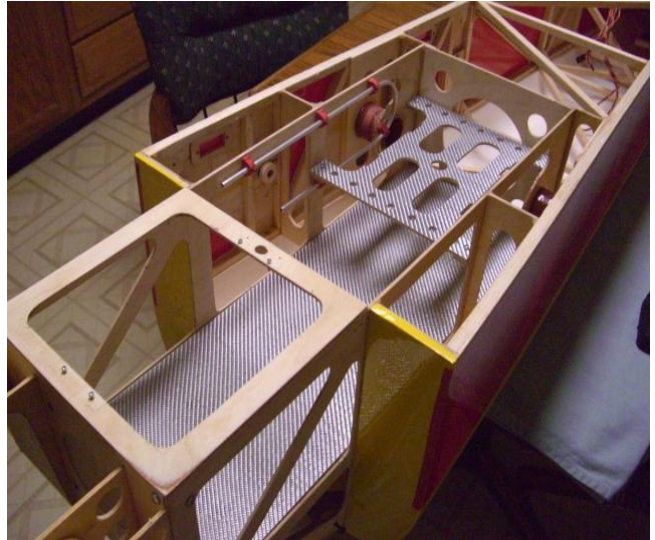
Look at the craftsmanship.